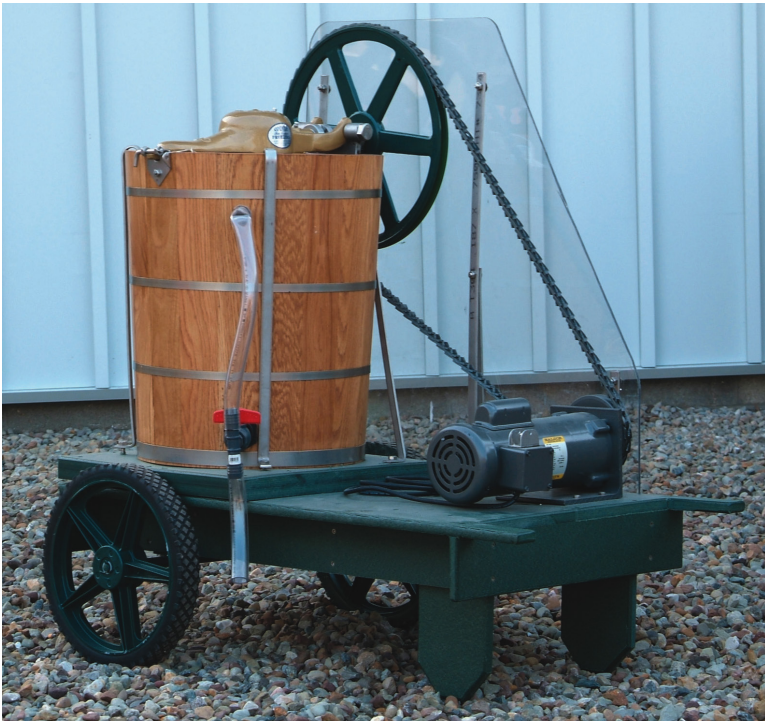
20-Quart Electric Ice Cream Freezer Cart #105-8290