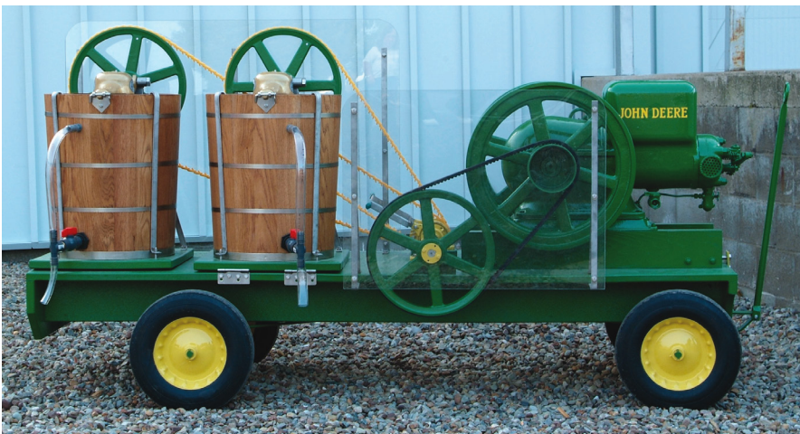
Large Ice Cream Trailer with Rubber Wheels #46-278